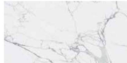
Statuario Freddo 120x240 cm F14LPTA1Y90 Lappato Matt F14LPTA1L90 Full Lappato

120x240 cm | 80x160 cm | 120x120 cm | 60x120 cm