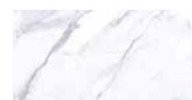
Michelangelo 80x160 cm F86LPTA0Y90 Lappato Matt F86LPTA0L90 Full Lappato