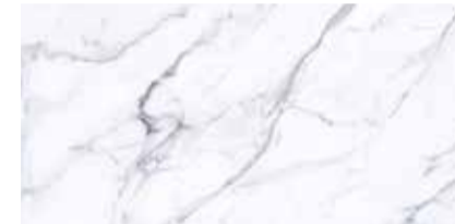
Michelangelo 120x240 cm F14LPTA0Y90 Lappato Matt F14LPTA0L90 Full Lappato