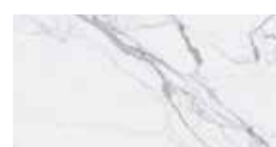
Statuario Freddo 80x160 cm F86LPTA1Y90 Lappato Matt F86LPTA1L90 Full Lappato