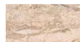
Breccia Aurora 80x160 cm F86LPTBOY90 Lappato Matt F86LPTBOL90 Full Lappato