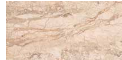
Breccia Aurora 120x240 cm F14LPTBOY90 Lappato Matt F14LPTBOL90 Full Lappato