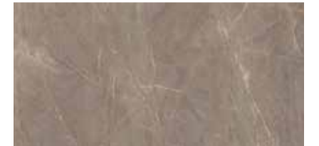
Amani Bronze 120x240 cm F14LPTFOY90 Lappato Matt F14LPTFOL90 Full Lappato