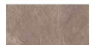
Amani Bronze 80x160 cm F86LPTFOY90 Lappato Matt F86LPTFOL90 Full Lappato